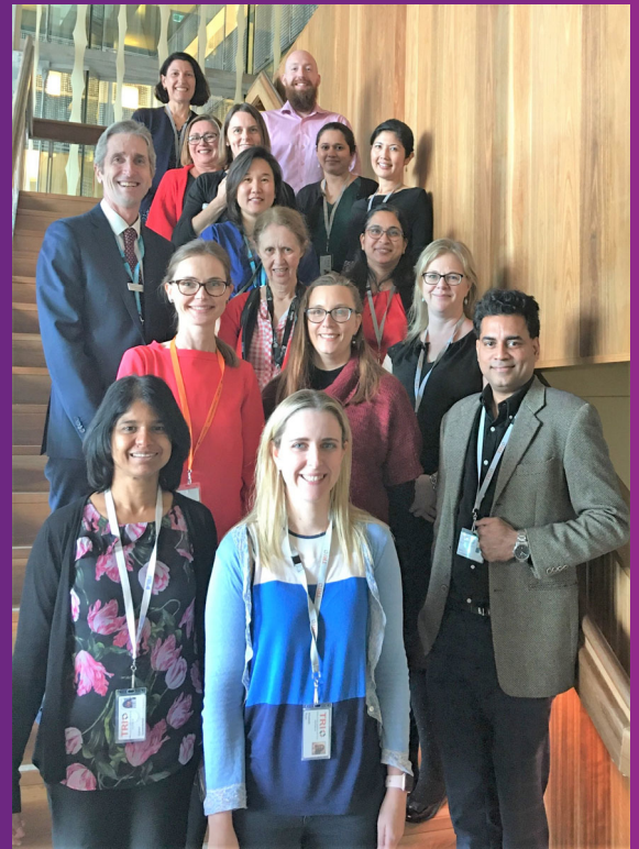
Pictured: AKTN team

Consumers are invited to help ensure that the design of our trials, and the documents we provide to the kidney community, are clear and useful.