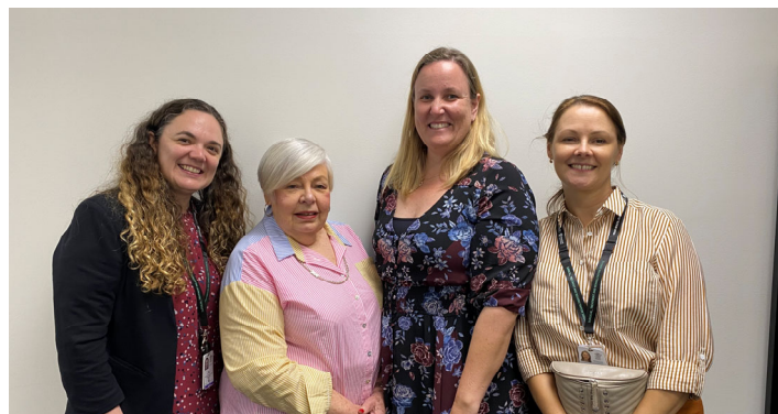
Pictured: Research Consumer Group Steering Committee

Surgical, Treatment and Rehabilitation Service (STARS) is a new public hospital in Metro North. It opened in 2020, providing rehabilitation services, as well as low complexity, elective and short stay procedures. The STARS Education and Research Alliance, with UQ, is bringing together excellent clinical care, education, training and research at STARS, creating involve consumers from the outset – in designing how we partner with consumers to design and carry out our research.